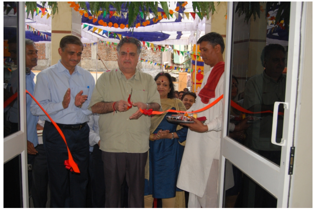
Ribbon cutting ......