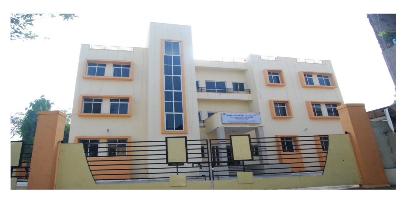
Newly constructed Ambaji Sub Division Office....