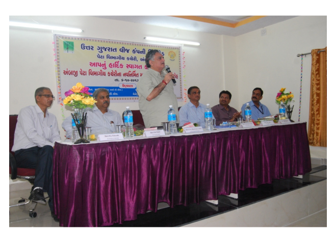
The Chairman delivering inaugural speech...