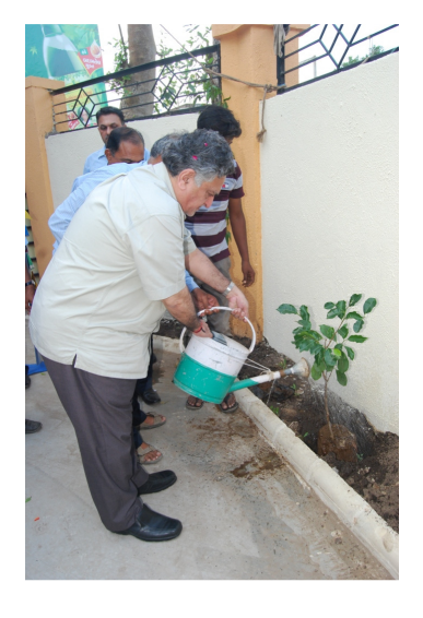
The Chairman watering the plant...