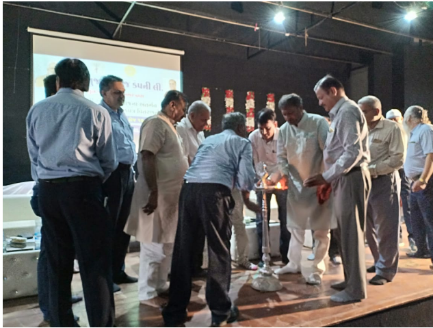
Hon. dignitaries lighting the lamp