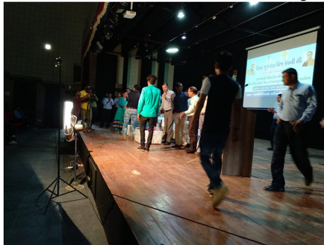
Issuance of appointment letters to selected apprentices