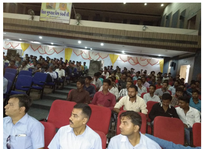
Apprentices during the event